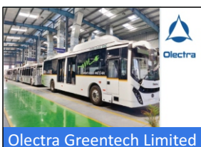
Olectra Greentech Limited