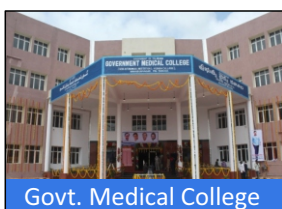
Govt. Medical College