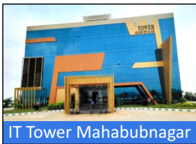
IT Tower Mahabubnagar