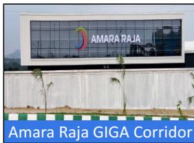
Amara Raja GIGA Corridor