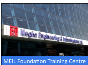
MEIL Foundation Training Centre