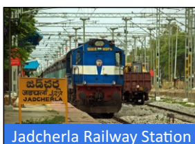
Jadcherla Railway Station