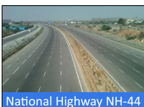
National Highway NH-44